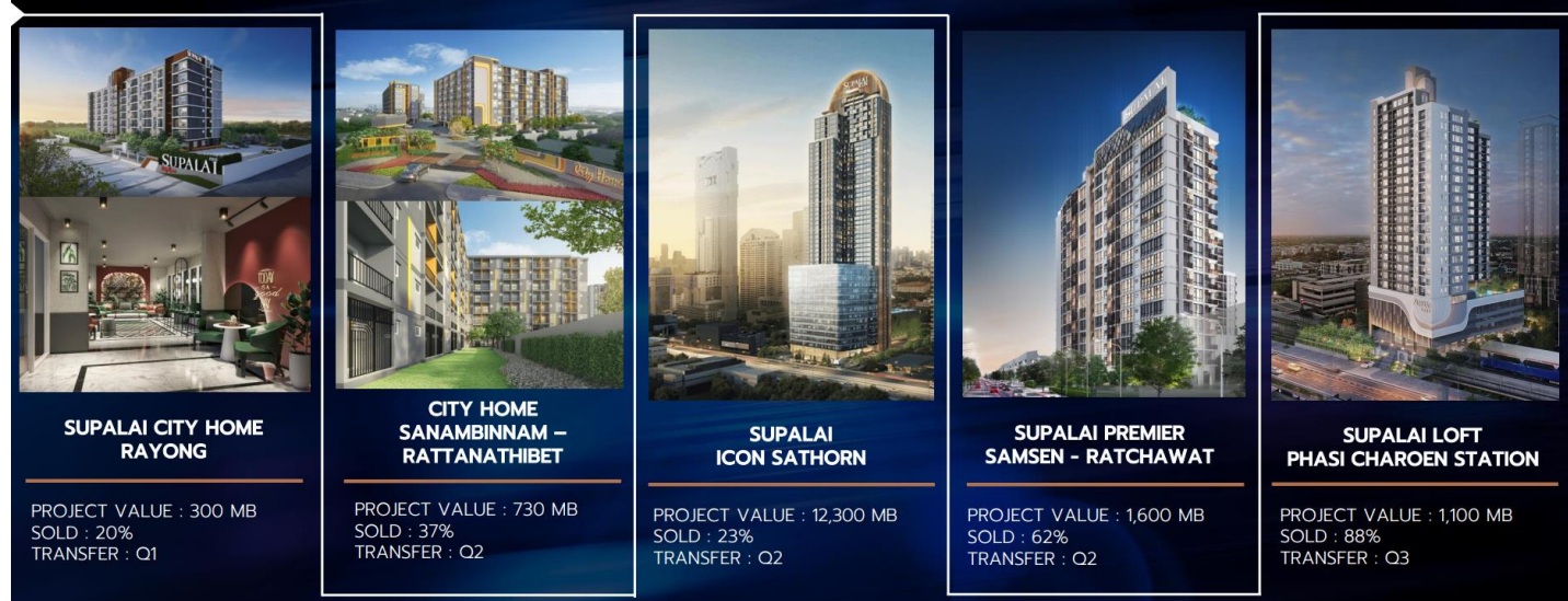
Figure 1: Supalai's condominium transfers to be mostly conducted in 2Q24 and 3Q24